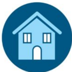
Stay home while you are sick; avoid others