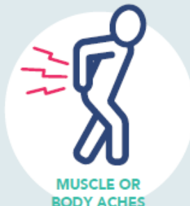
MUSCLE OR BODY ACHES