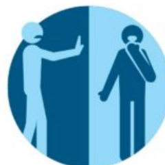
Avoid contact with sick people