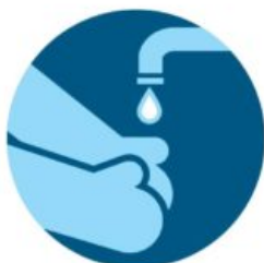
Wash hands often