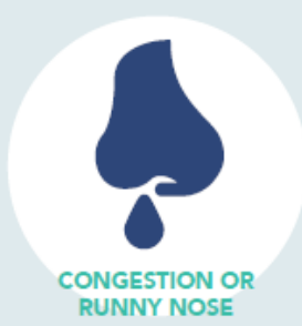
CONGESTION OR RUNNY NOSE