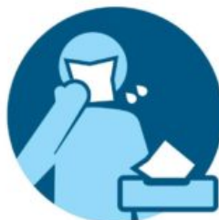
Cover mouth/nose with a tissue or sleeve when coughing or sneezing