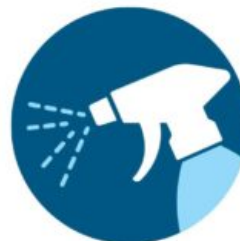
Clean and disinfect frequently touched objects and surfaces