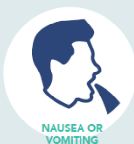
NAUSEA OR VOMITING