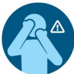
Avoid touching eyes, nose, or mouth with unwashed hands